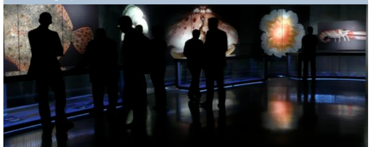
Project partners visiting an exhibition in the OZEANEUM, German Oceanographic Museum in Stralsund

Stralsund University of Applied Sciences www.fh-stralsund.de | German Oceanographic Museum www.meeresmuseum.de | University of Szczecin www.us.szc.pl | Gdynia Aquarium www.aquarium.gdynia.pl | Lithuanian Sea Museum www.juru.muziejus.lt | Museum of the World Ocean http://world-ocean.ru